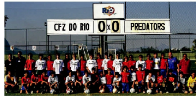
MSC Predators U-14 vs. CFZ do Rio

Players will train with Professional Brazilian Soccer Coaches at the Zico Center, and they will play against the best local youth soccer teams.