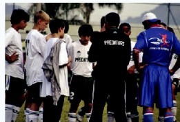
Top notch coaching